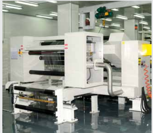
Tier I Cleanroom Coating and Laminating Line