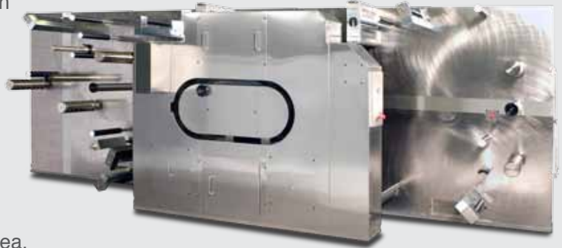
Tier II Cleanroom Pilot Line