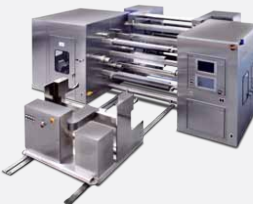
Turret Unwind with Automatic Roll Handling Cart