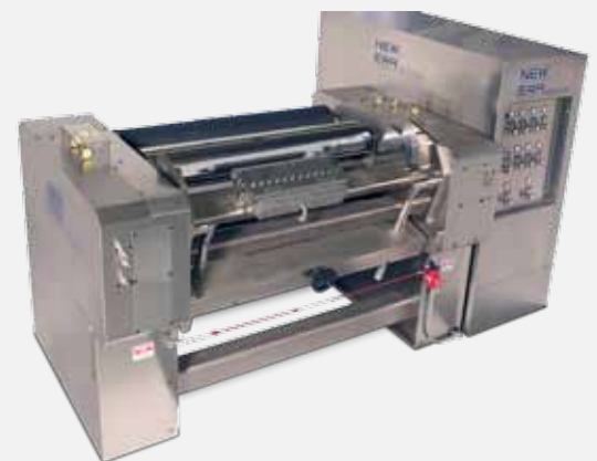
Cleanroom Combination 4-Roll Reverse Roll and Die Coater