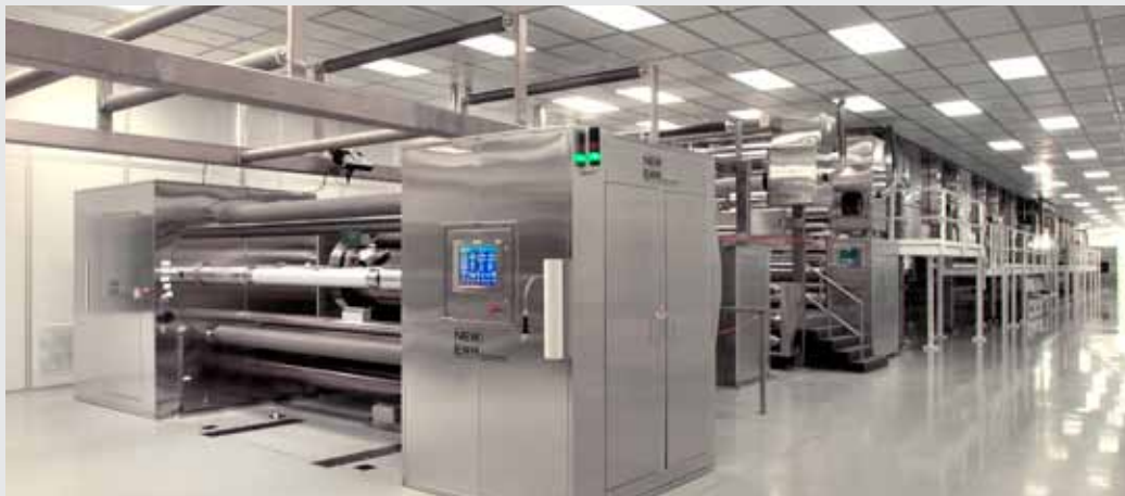
Tier II Two-Station Cleanroom Coating Line