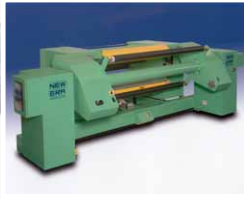
Automatic Turret Unwind