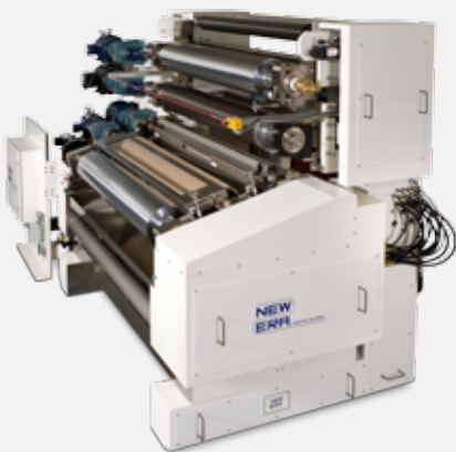
Cartridge Style Cleanroom Coater