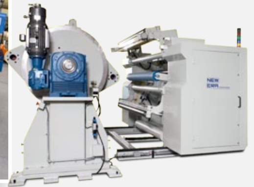
J-Arm Winder for Tapeless Cores