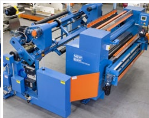
Automatic Turret Unwind with Multiple Splicing Methods