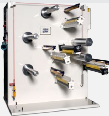
Modular Cantilevered Unwinds and Winders