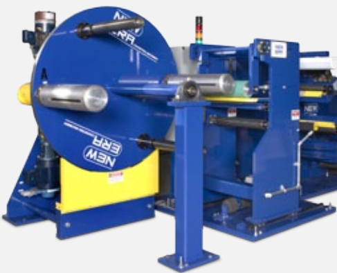
Cantilevered Turret Winder