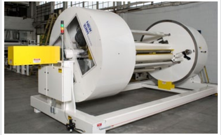
Constant Geometry Turret Winder

New Era offers unwinds to handle a wide variety of applications, from simple single position braked units to fully automatic, multi-position, continuous operation units. We offer various standard and specialty splicing assemblies designed to meet our customers needs. Our patented on-the-fly Two Ply Splicer allows for continuous, automatic splicing of both layers of a two-ply web. Our patent pending Butt-Splicer provides automatic, on-the-fly butt splices.