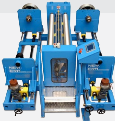
Dual Position Drop-Splice Nip Unwind