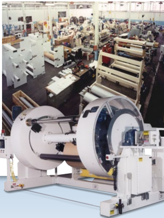
Flying Transfer Winder with Traveling Pack/Gap Rolls