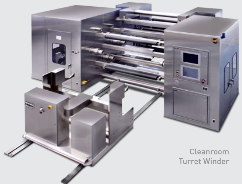
Cleanroom Turret Winder

Transfers can be accomplished using taped or untaped cores. Our unique Tail Ironing System and patented Carousel Winder both allow for automatic zero fold over transfers on even the most difficult to cut materials.