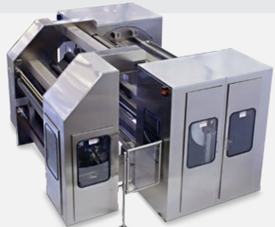
Flying Shear Turret Unwind