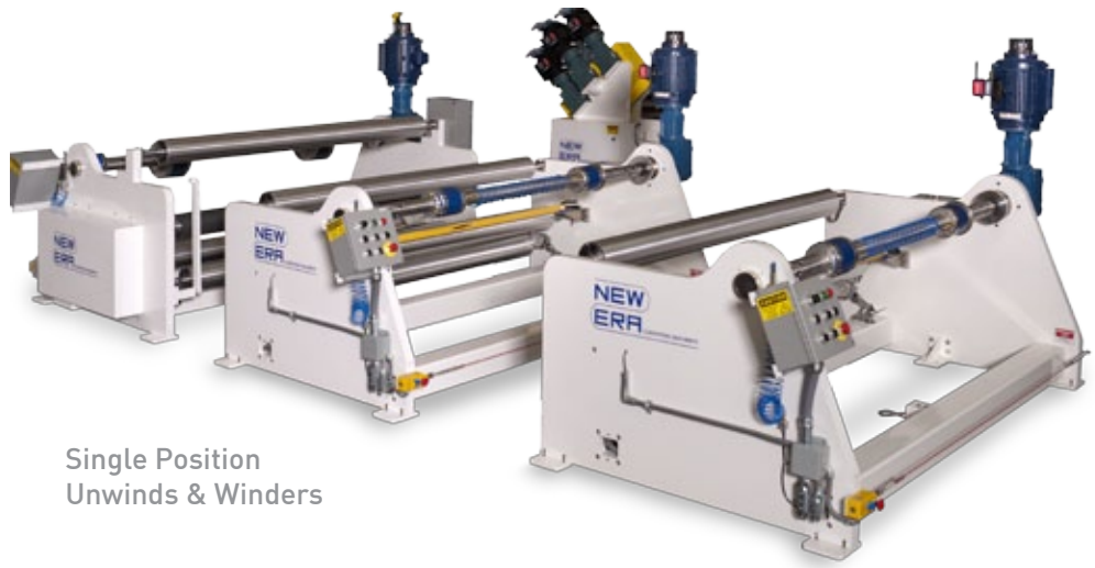
Single Position Unwinds & Winders

Whether the solution is a standard Unwind or Winder module, or a specialized system, New Era can provide a cost effective solution to fulfill your requirements. We maintain a production scale Unwind/Winder Test Facility to aid in the selection process. New Era also offers a complete line of roll handling equipment to seamlessly interface with our Unwinds and Winders.