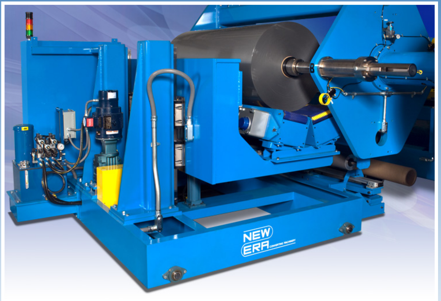
Automatic Roll Handling Cart with Core Loading