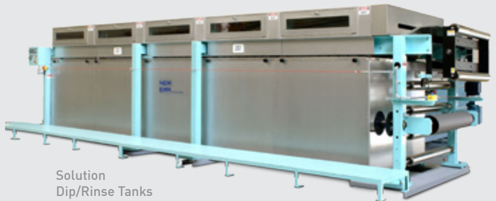
Solution Dip/Rinse Tanks