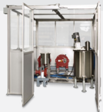
Slurry Mixing and Pumping System