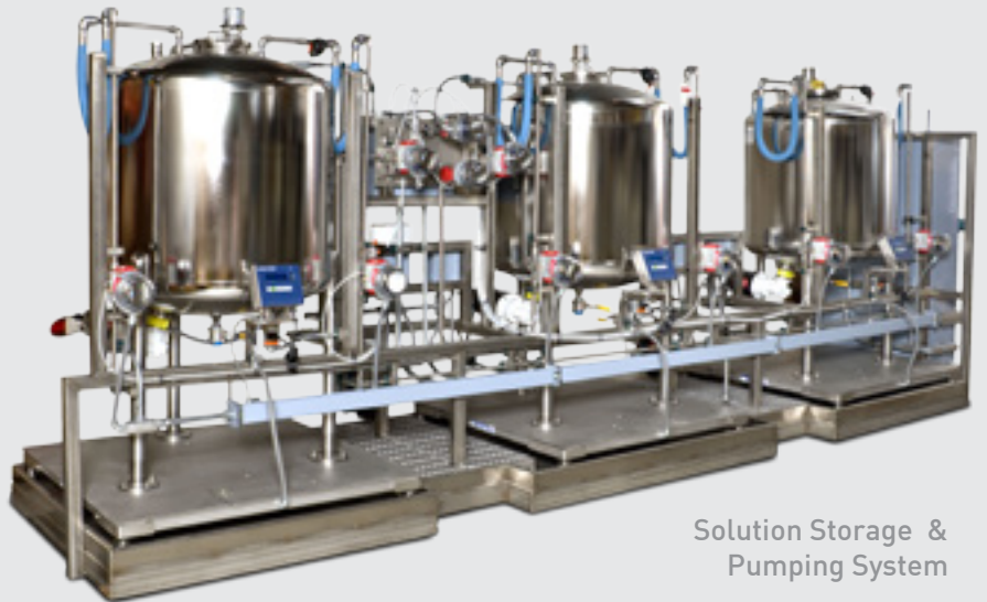
Solution Storage & Pumping System

Essential to any coating application is the ability to properly deliver the solution to the process equipment. This requires the integration of many components into a properly engineered system. New Era's experience with both solution handling and coating equipment allows us to provide systems designed to meet the customers' requirements in a seamless fashion.