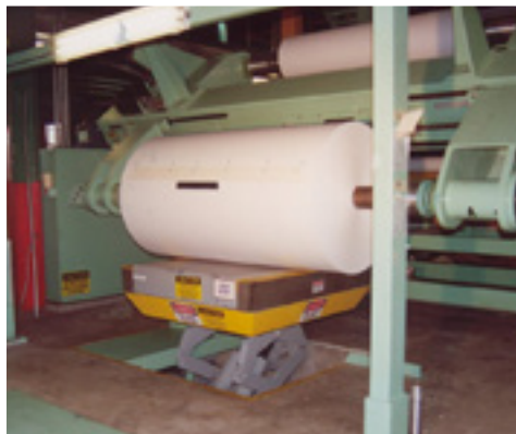
In-floor Scissor Jack Roll Loading System