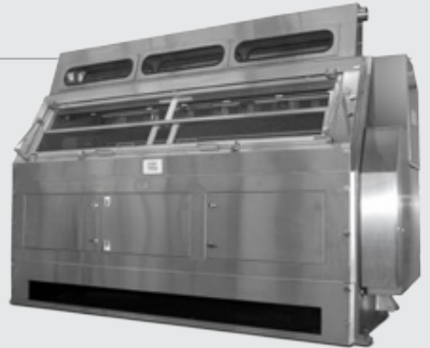
Close Fitting Coater Enclosure

Certain web processing elements require strict control of their surrounding environment. This could be for capturing fugitive emissions, coating mist abatement, temperature control, solution exposure/rinsing, and/or humidity regulation. It is important that the supplier understands the enclosures' purpose as well as how best to accomplish it without adversely affecting the operation of the processing equipment. New Era's engineering staff has the experience required to optimize the interfacing of these two goals and deliver a system that fulfills the customers' needs.