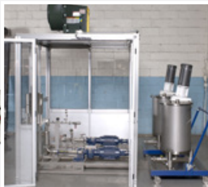
Dual Pump System with Transportable Mixing Tanks