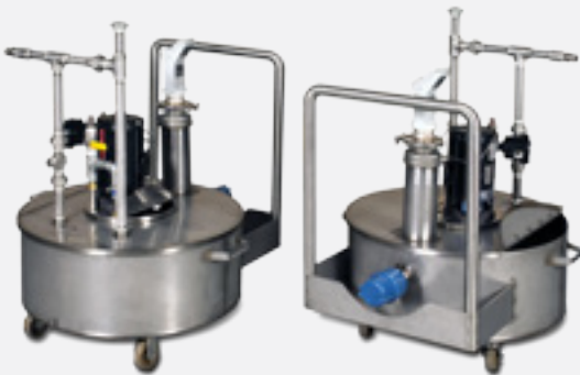
Transportable tank/pump system