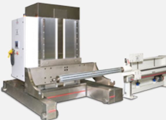
Automated Roll Handling Cart with Airshaft Extractor