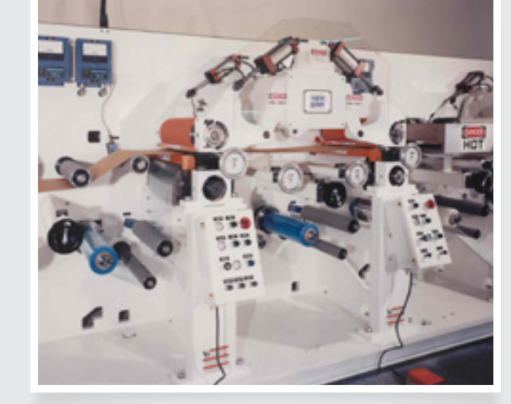
Narrow Web Embossing Line

New Era takes great care in the design of its clean room laminators, embossers, and calenders to both minimize the number of debris generating components on the equipment as well as shroud any moving components under enclosures. This leaves a clean configuration between the frames, with all machine members being of nickel plated or stainless steel construction.