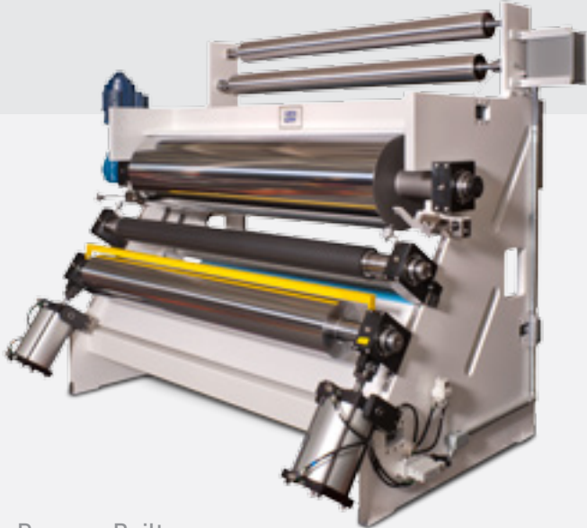
Purpose Built Laminator with Backup Roll

New Era embossing equipment is custom engineered to meet your process requirements. Our experience with a wide variety of embossing methods and processes goes into the design of every embossing system we provide.