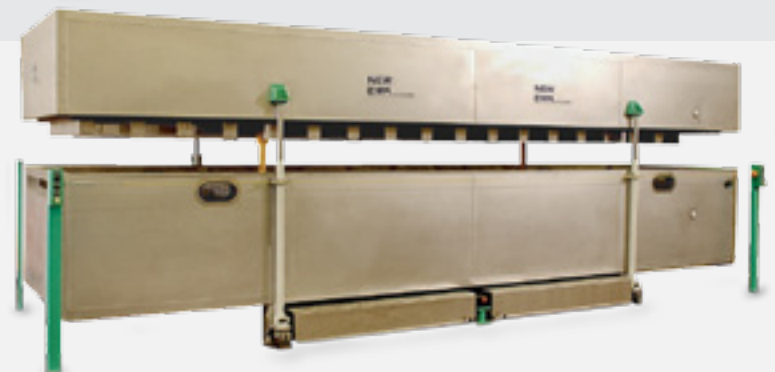
Single Zone Top Retraction Air Floatation Dryer