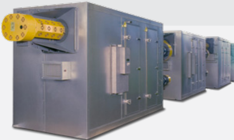
Prepackaged Dryer Apparatus Units