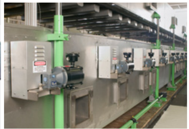
Purpose Designed Top Retraction Roll Support Dryer