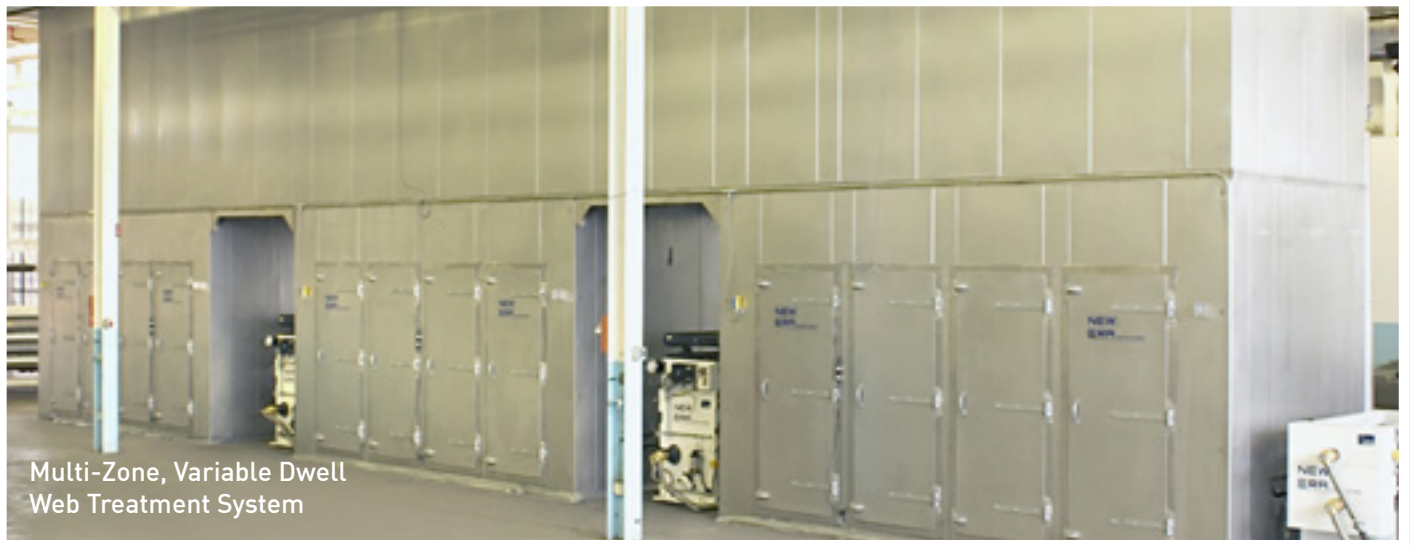
Multi-Zone, Variable Dwell Web Treatment System