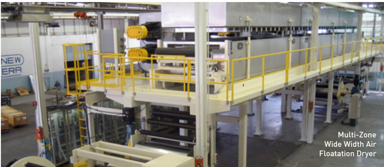
Multi-Zone Wide Width Air Flotation Dryer

The New Era applications team draws on many years of experience with a wide variety of web materials, coating/impregnation solutions and processes.