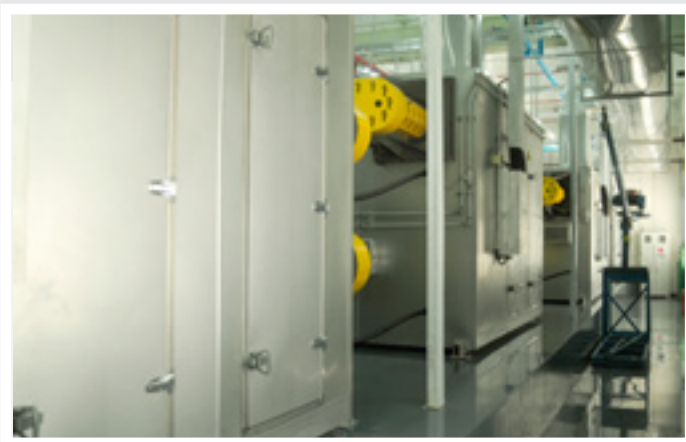
Installed Dryer Apparatus Units