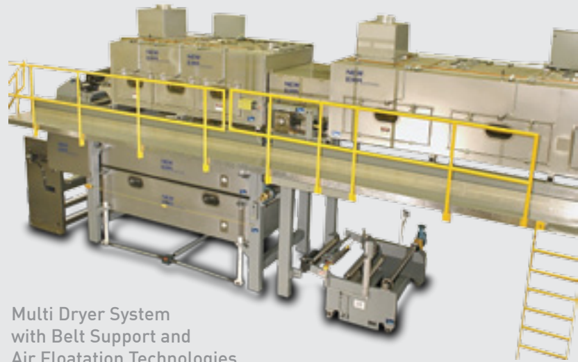
Multi Dryer System with Belt Support and Air Floatation Technologies

Our 26" wide in-house pilot line facility, with its high speed capability, multi-mode coater, and three zone floatation dryer, plays an important role in developing the appropriate process parameters for new products.